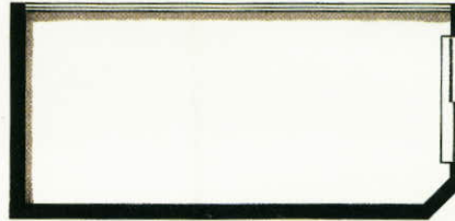
Optional 2nd floor viewing deck